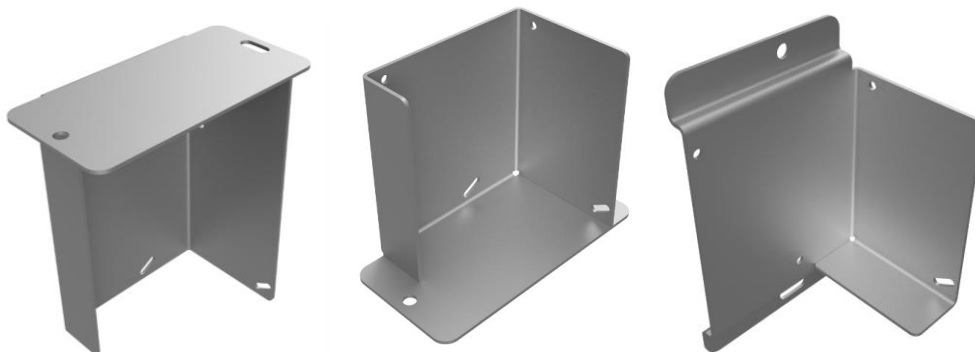
Figure 1: Possible mounting brackets configuration (wall, floor, and ceiling).