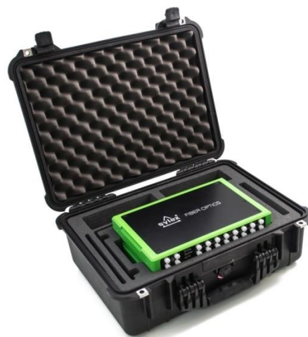
Figure 2: Waterproof, crash proof and dust proof transportation case as optional packaging

For more information contact our sales team at sales@sylex.sk