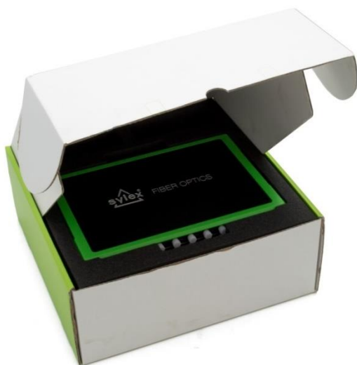
Figure 1: Cardboard box as standard packaging